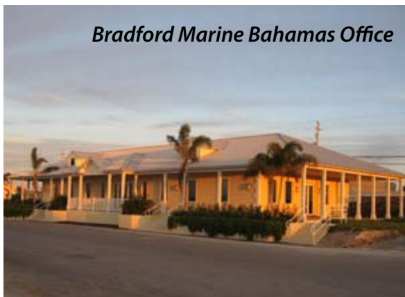
Bradford Marine Bahamas Office

There is no finish line when providing service.”