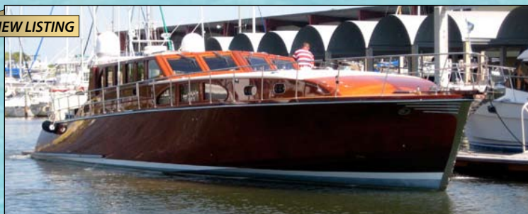
"Miss OSB" - 2009 65' Hugh Saint Custom Asking $995,000 - CA Tucker Fallon