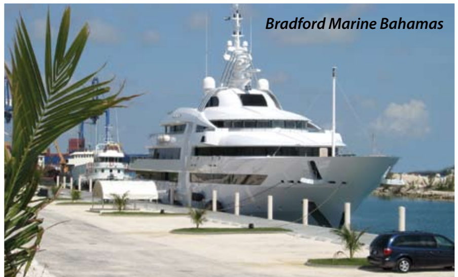
Bradford Marine Bahamas