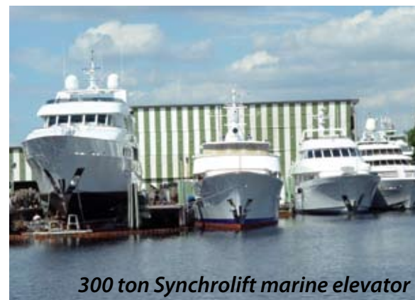
300 ton Synchrolift marine elevator

Bradford Marine has created new and unique ways to provide efficiencies in buying, selling, and chartering yachts along with its traditional yacht service. Innovations include on-site contract specialists who can give financial institutions confidence that transactions are structured properly. In-house expertise can be accessed for any reason, from dealing with Customs to the intricacies of classification societies and international sales. The development of Bradford Marine’s Freeport shipyard has been a popular port of call for owners, captains and crew cruising in the Bahamas, providing the high quality services and technical support they depend on.